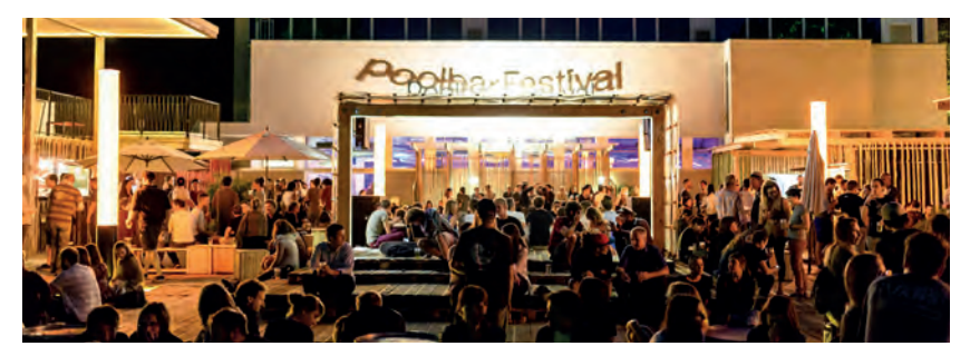
Great music and atmosphere at the poolbar festival, which takes place every year for six weeks in the Old Indoor Pool in Feldkirch. | LEFT The University of Applied Sciences offers practice-oriented training with state-of-the-art infrastructure.

Also, the following initiatives offer support for expats and/or opportunities to make friends: Expats in Vorarlberg (Facebook-group) www. facebook.com/groups/ExpatsinVorarlberg, femail (multi-linguael service center especially for women) www.femail.at, Meetup Vorarlberg-(make friends) www.meetup.com/Vorarlberg-International, Relocation Services Höfler (Support before, during and after your move) www. relocates-you.com.