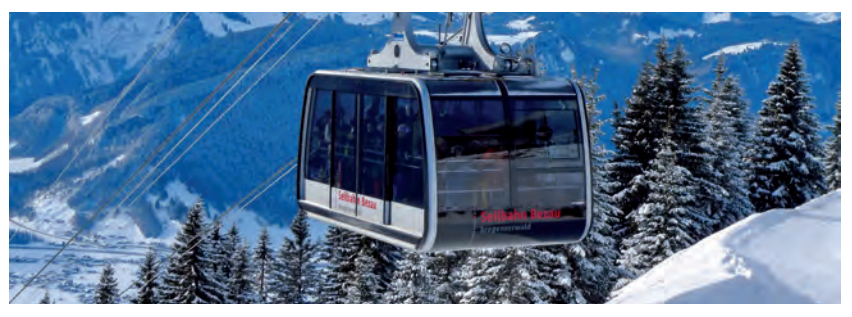
Vorarlberg is home to powerful brands – with Doppelmayr being one of it. The world market leader in ropeway construction has installed more than 14,700 ropeways in 90 countries. ©Doppelmayr | RIGHT Language courses are held in small groups and are a good way to find new friends. ©WISTO

German is the official language in Austria and thus a prerequisite for permanently living and working in Vorarlberg. Some may find that the dialect used in this area is somewhat far away from Standard German, however, this is probably the case for most regional dialects in every language. The good news is that you will find no problems getting around with Standard German and English.