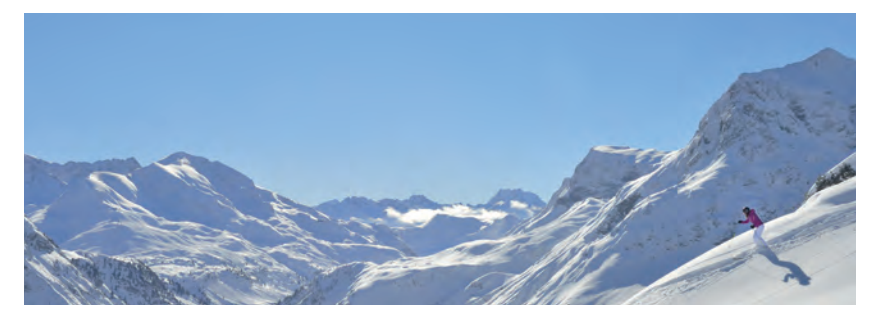
Lech-Zürs, with its 305 kilometres of ski runs and over 200 km of high Alpine powder runs, is the most successful ski resort in the entire Alpine region. @Sepp Mallaun/Vorarlberg Tourismus | LEFT The POSTGARAGE at CAMPUS V provides a digital innovations hub for start-ups, initiatives, institutions and companies. @PRISMA

By law normal working hours in Austria are up to 8 hours a day, up to 40 hours a week. Depending on industry and collective agreement deviations are possible (e.g. 38,5 hours per week). Employees are entitled to take 5 weeks of paid