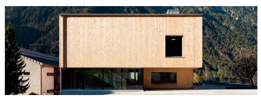
The municipal office in Innerbraz does not only offer its services to the citizens, but also convinces by its design. | LEFT The newly opened Sutterlüty Ländlemarkt at Jahnplatz in Feldkirch.

It is common that your landlord asks you for a deposit, that is about three times the monthly