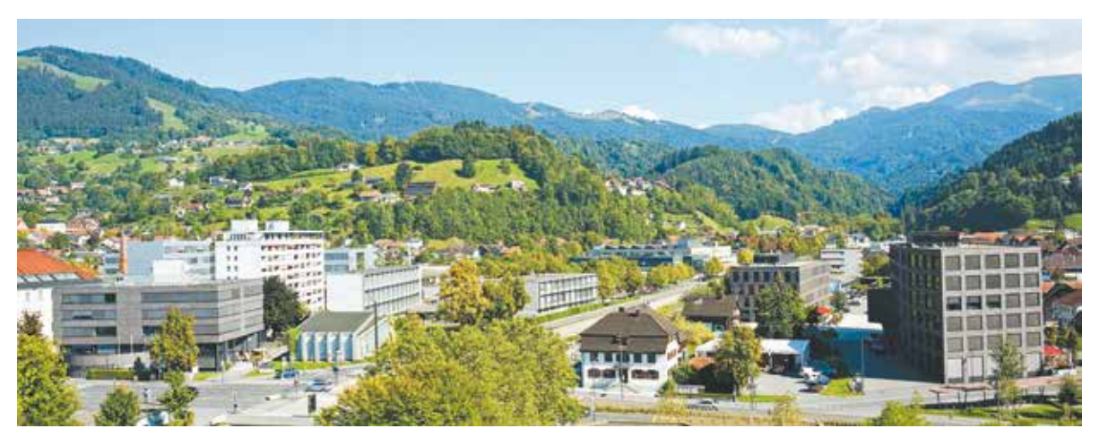
With the CAMPUS V in Dornbirn, step by step a new urban district is being created, where business, research as well as the creative industry will be linked even better. Visitors can see first hand the excellent regional craftsmanship that goes into local products at Werkraum Bregenzerwald in Andelsbuch.

The 2019 inaugurated Postgarage on the CAMPUS V is just one next step towards developing the CAMPUS V into the biggest innovation hub within the region.