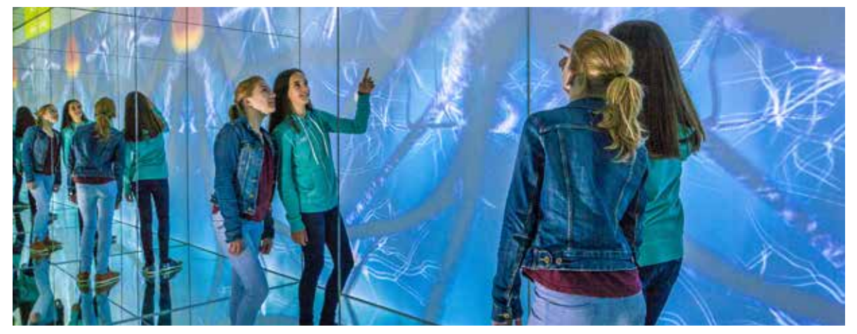
The inatura experience lets visitors discover more about nature and technology in an exciting atmosphere. TOP Elite international education in the "Four Country Region".

The ISR's objective is to afford even young children an internationally oriented education and bring together different cultures. A number of different studies confirm its success. www.isr.ch