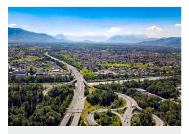
A MODEL REGION FOR ENERGY EFFICIENCY

Cleantech can be defined as the use of technology to sustainably reduce emissions and resource consumption while maintaining or improving performance. Voralberg's businesses not only see cleantech as a market full of potential, but also as a comprehensive philosophy.