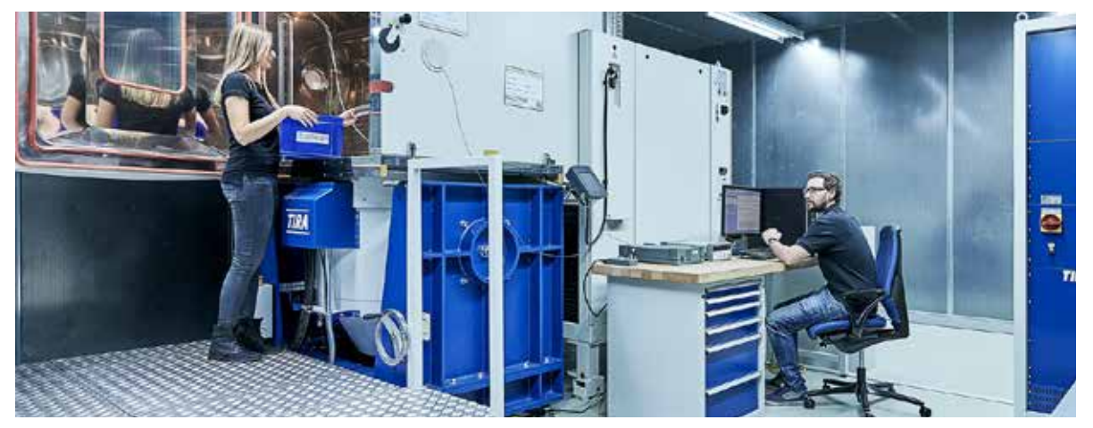
In 2018, Vorarlberg broke the 10 billion euro mark in exports for the first time. Hirschmann Automotive, for example, supplies premium automotive manufacturers such as Mercedes, BMW and Audi and generates over 95% of its sales abroad. | TOP Branches of 15 selected Vorarlberg companies (without sales partners).

Vorarlberg's products are in use around the world, providing local professionals with opportunities for global careers.