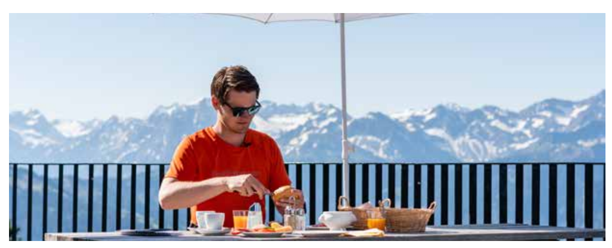
Many panorama restaurants offer delicious breakfast deals with a fantastic view, such as the new Panoramarestaurant Baumgarten. | TOP In the cheese cellar in Lingenau you have the opportunity to watch about 32,000 loaves of alpine cheese ripening and to taste the various types and specialities of cheese.

Also vegans find several offerings in Vorarlberg: from stuffed pancakes and wraps, cakes and sweets to breakfast and brunch possibilities. The menu in the new Lieblingscafè (Favourite Café) in the heart of Bregenz is completely vegetarian and vegan. www.lieblingscafe.at