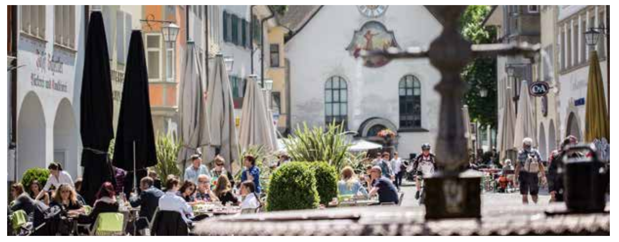
Vorarlberg offers a unique combination of mountains, lake, culture, architecture, urban life style and a strong economy. | TOP Lech-Zürs is one of the most popular ski resorts in the Alps.

The cornerstone of Vorarlberg's appeal is its economic strength, ranking it among major international metropolitan regions such as Paris and Munich.