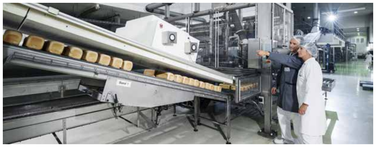
Ölz Meisterbäcker is the market leader for toast bread and bakery products. | TOP The company Doppelmavr is the world market leader in ropeway engineering and has built ropeways in 90 countries on 5 continents.

Leading specialist of highly elastic materials for vibration insulation (e.g. for railway tracks and skyscrapers) Employees: 359 / 459