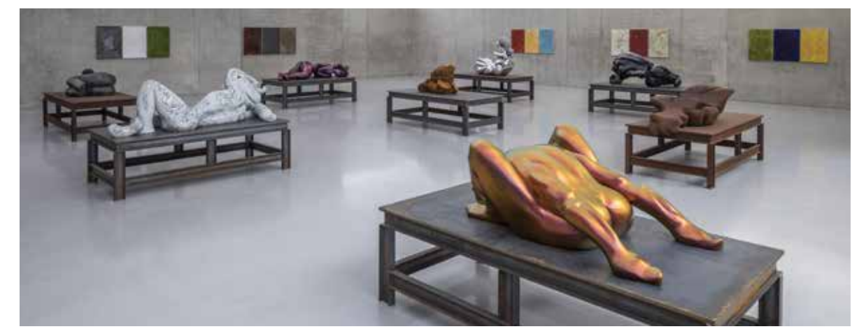
In 2019, the exhibition of the German sculptor and draughtsman Thomas Schütte, one of the most important contemporary artists, took place at the KUB. | TOP Every first Friday of the month there is free entrance to the KUB. During the KUB Open Air Summer, the favorite films of the artists of the KUB year will be shown – also with free entrance.

The inatura natural science and technology museum in Dornbirn is paving the way to a new kind of museum culture. It reveals the secrets of nature in Vorarlberg in a playful and entertaining manner. The museum also covers future technologies such as bionics. The newly installed Science Centre is designed to increase children's curiosity for science and technology. www.inatura.at