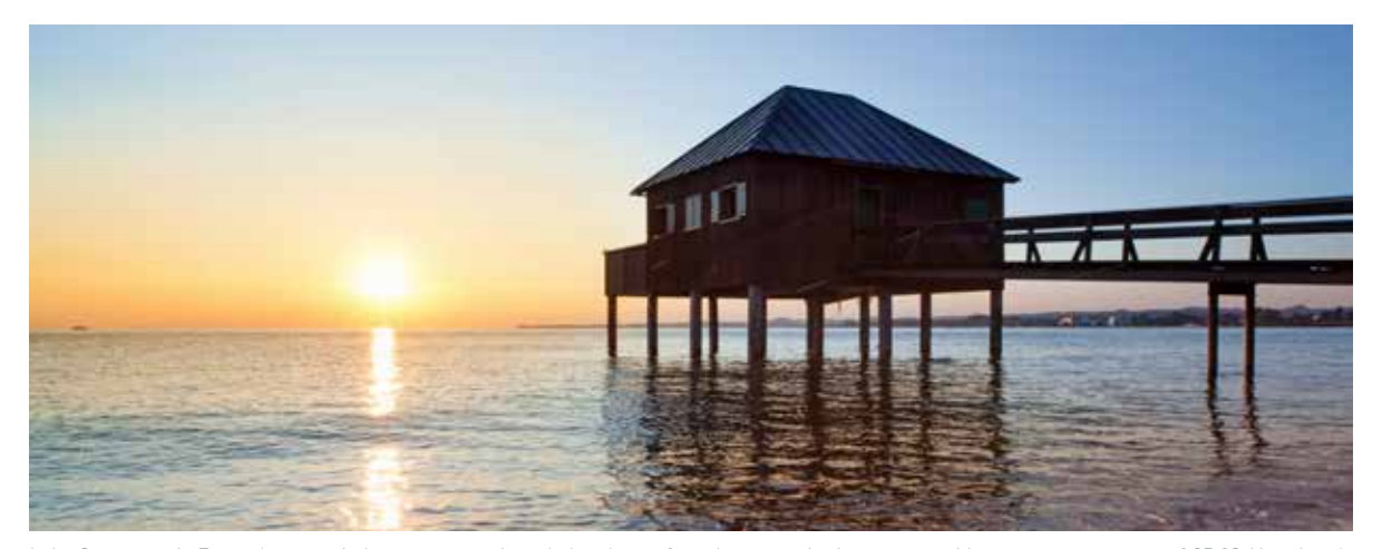
Lake Constance is Europe's most vital water reservoir and also the perfect place to swim in summer with water temperatures of 25 °C. Vorarberg's side of Lake Constance offers free access to the lake almost along the entire shore. Oberhauser Photography/Vorarlberg Tourismus | TOP LEFT Beat Kammerlander climbing the Bürs plate cliff. ©Planet Talk | TOP RIGHT Gigi Rüf is one of the most successful professional winter athletes from Vorarlberg. ©Scott Sullivan/ESPN

At the Freeride World-Tour 2019 in Hakuba in Japan he reached the sensational second place.