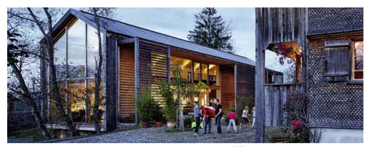
The Bregenzerwald is known for its architecture. ©Adolf Bereuter/Bregenzerwald Tourismus | TOP The bus stop in Krumbach by Rintala Eggertsson Architects (Norway) with the partner architect Baumschlager Hutter Partners in Dornbirn. ©Felix Friedmann/Bregenzerwald Tourismus

The high standards of aesthetics and architecture are also noticeable in daily life: when there was a need for renovating the bus stops in the small community of Krumbach, it was decided to combine mobility and building culture. Architects from all over the world designed 7 bus stops for the 1,000-inhabitant village in the Bregenzerwald, which were then built in cooperation with local architects and craftsmen. As a result, the small village has attracted attention in the architecture scene worldwide.