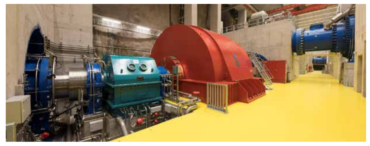
With the expansion of renewable energy sources, electromobility and smart grid technologies, illwerke vkw is making a contribution to Vorarlberg's energy autonomy. The photo shows the Obervermuntwerk II on the Bielerhöhe, which opened in 2019. | TOP Sustainable mobility is one of Vorarlberg's environmental objectives.

Citizens of Vorarlberg appreciate nature and have their eyes set on the future. With the VLOTTE project the state is setting an example in the field of electromobility, as London does. Sustainable thinking reaches from energy efficient homes to eco-friendly forms of transportation all the way to futureoriented education and responsible business practices.