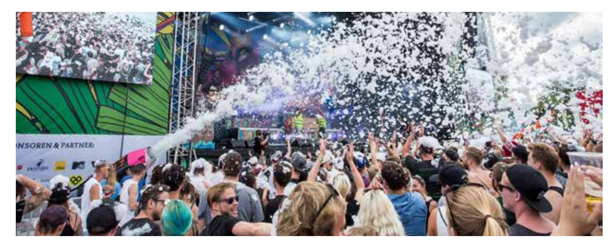
Great bands and good atmosphere at the Szene Open Air in Lustenau. | TOP LEFT Musical diversity and dishes from all over the world at the Origano Festival on Dornbirn's market square. | TOP RIGHT The poolbar Festival has a lot to offer - from jazz breakfast in the park to cinema, open air, poetry slam, performances up to concerts.

Also worth seeing are the New Orleans Festival in Hohenems, the Harbour Festival in Bregenz, Feldkirch's Wine Festival , the Kilbi in Altenstadt, the ALPINALE Short Film Festival and the summer concert series SommERleben in Dornbirn as well as Sommer.Lust am Platz in Lustenau.