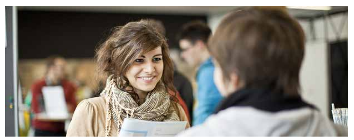
FH Vorarlberg ranks high among universities thanks to its practical training, excellent facilities and international education. | TOP LEFT The Apprenticeship Programme, which combines theory and practice, is of great importance in Vorarlberg. | TOP RIGHT An overview of the education system in Austria.