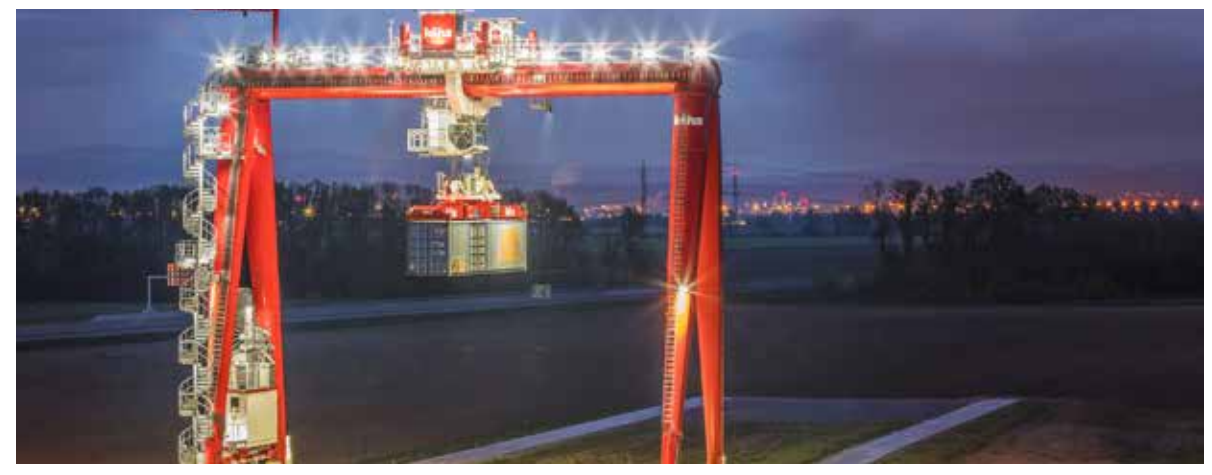
Almost every industrial harbour in Europe uses container, harbor or RMG cranes by Künz, the market leader for container cranes in Europe and North America. | TOP In 2018, Gebrüder Weiss handled 13.4 million consignments (land transport), 108,000 standard containers (sea freight) and 61,000 tonnes (air freight).

www.zumtobelgroup.com Global market leader in the areas of electronic lighting technology and professional lighting systems