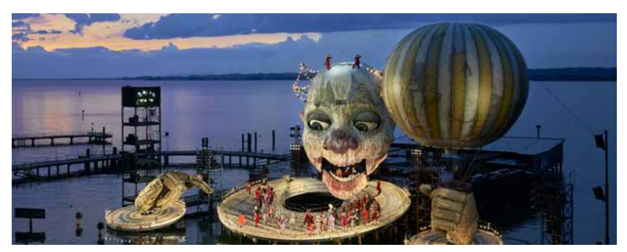
The Bregenz Festival performances have an international reputation – also because of the unique atmosphere and location. ©Anja Köhler/Bregenzer Festspiele | TOP LEFT The Festival spreads an inspiring ambience all over the esplanade of Bregenz. ©Anja Köhler/Bregenzer Festspiele | TOP RIGHT Bregenzer Spring hosts a number of exceptional dance performances. ©Antero Hein/Bregenzer Frühling

60 km south of Bregenz the Montafoner Resonanzen Culture Festival impresses visitors with a wide range of musical genres and locations. From open-air jazz on the reservoir to late Baroque period operas in a farmhouse through to Montafon folk dance in an open dance arbour. The festival is held every August and aims to familiarise visitors with the rich, unique variety of Montafon and its culture. www.montafon. at/montafoner-resonanzen