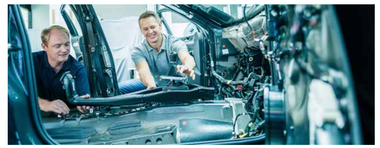
Carcoustics develops and produces acoustically and thermally effective components for the automotive industry, coffee machines, vacuum cleaner combine harvesters and other equipment. For the second time in a row, the company has been named as a Top Employer Austria. | TOP THIEN eDrives supplies companies such as Daimler with its highly innovative electric motors.

Viessmann (Mawera/Köb) Competence centre for bioenergy Employees: 140 / 11,600