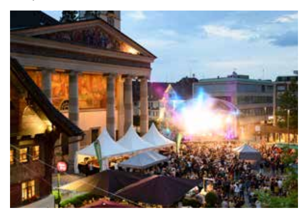
"Dornbirn's market square is transformed into a huge open-air bar every Thursday in the summer."

And night life wouldn't be complete without a number of events, concerts and festivals to choose from. The major cities of Dornbirn, Bregenz and Feldkirch are known for their many bars and events.