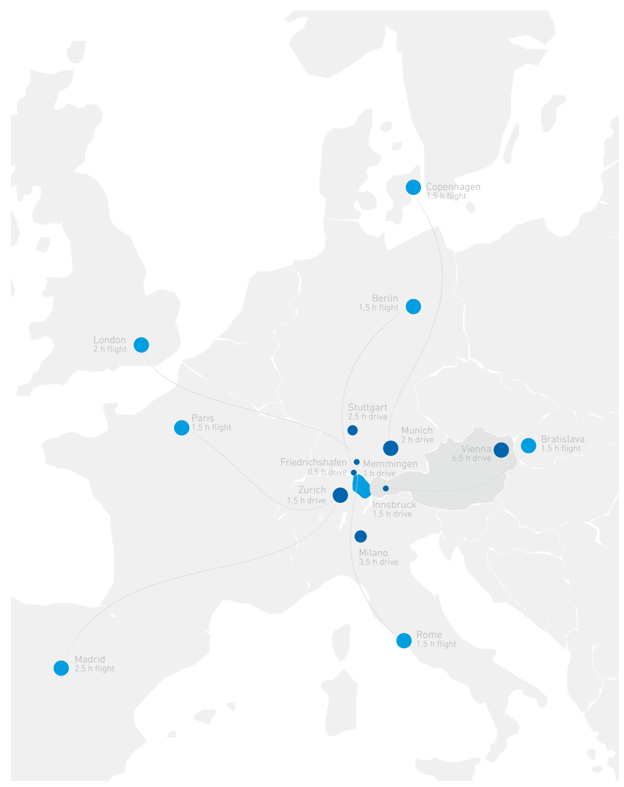
Vorarlberg lies within Europe's most dynamic technology regions. The picture shows the nearest airports and distances to major European cities.