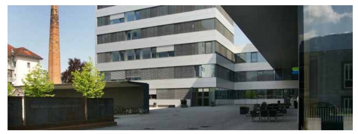
FH Vorarlberg offers state-of-the-art technology and infrastructure for its students and allows them to use it for own projects - Open Lab. | TOP Why do electrical sockets have two holes? – KINDERUNI VORARLBERG (Children's University) features special lectures for children.

FH Vorarlberg organises together with the Vorarlberger Landeskonservatorium and the PH Vorarlberg the KIN- DERUNI VORARLBERG , where professors and industry experts present content to children in special lectures designed to be both informative and entertaining. Divided into two semesters, there are monthly lectures for children aged 8 to 12. The project aims to peak children's curiosity for science and encourage them to pursue a college education early on.